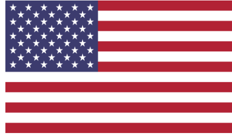
The flag of the United States of America, the birthplace of jazz.

The earliest jazz bands included four or five different instruments: