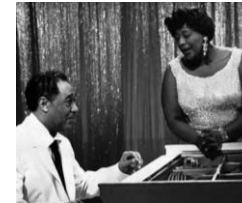
It Don't Mean a Thing by Ella Fitzgerald and Duke Ellington