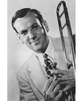
In the Mood by the Glenn Miller Orchestra