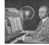
The Entertainer by Scott Joplin