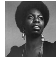
Comparing Feeling Good by Nina Simone with the version by MUSE