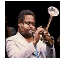
Salt Peanuts by Dizzy Gillespie