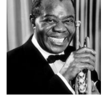
Oh When the Saints Go Marching In by Louis Armstrong